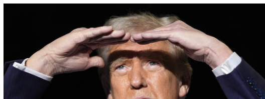
READ MORE: Trump accuses UK officials of election interference – politico

“What a terrible thing for Democracy!” he added, noting that the alleged election meddling came “from a Foreign Country, one that many consider our Number One Ally.”