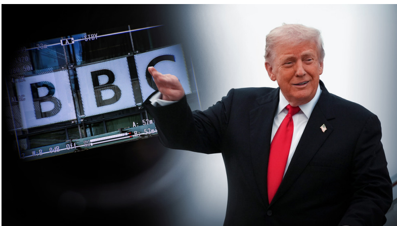
RT composite. © Leon Neal / Getty Images; AP Photo / Manuel Balce Ceneta

The US president has thanked The Telegraph for exposing their “corrupt” competitors