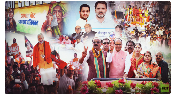
'It's not just a political contest': These elections may be rewriting India's political playbook FEATURE

Dear readers! Thank you for your vibrant engagement with our content and for sharing your points of view. Please note that we have switched to a new commenting system. To leave comments, you will need to register. We are working on some adjustments so if you have questions or suggestions feel free to send them to feedback@rttv.ru . Please check our commenting policy