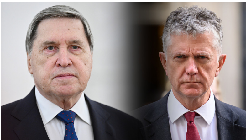
Russian Presidential Aide Yuri Ushakov (L); British National Security Adviser

London ignored Moscow's position on Ukraine during an attempt to reopen dialogue, spokesman Dmitry Peskov has said