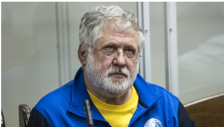
Ukrainian business tycoon Igor Kolomoysky in a court in Kiev, September 2,

Jailed tycoon Igor Kolomoysky reportedly cooperated with Western-backed investigators to take down the Ukrainian leader