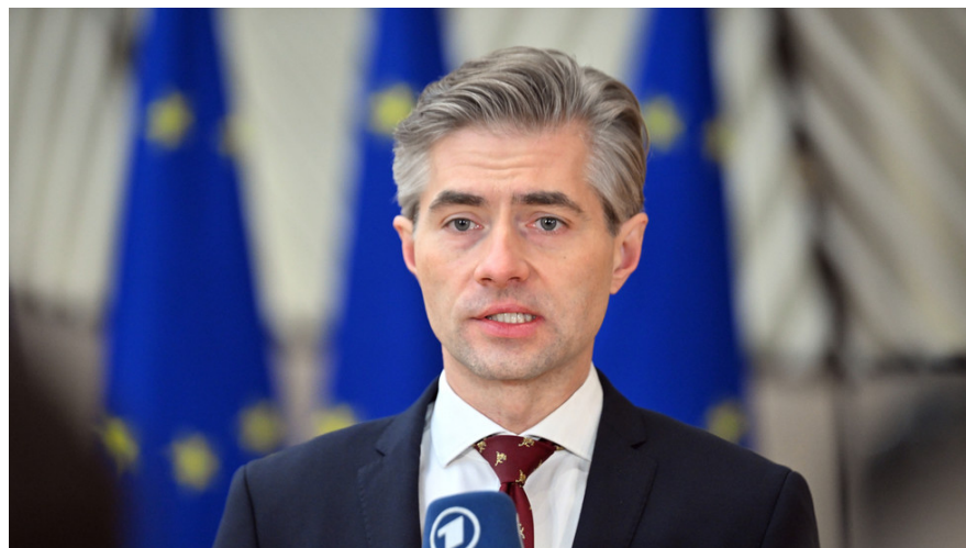
Lithuania's Foreign Minister Kestutis Budrys.

The bloc will not be able to play a “relevant role” unless it acts now, Lithuanian Foreign Minister Kestutis Budrys has claimed