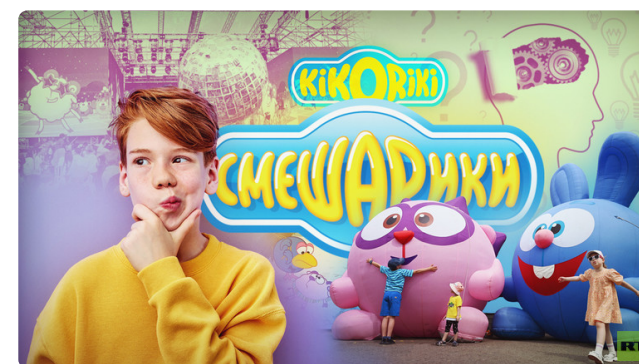
Sesame Street on antidepressants: This children's cartoon teaches Russians about death FEATURE