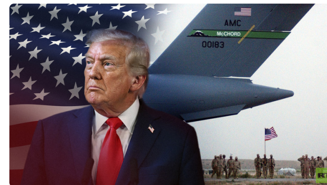
The ghost of Bagram: America's bid to rewrite its defeat in Afghanistan FEATURE

Mi Samsung 10/1/2025 at 1:51 PM ↑ -3 They pave the roads, take away your rubbish, teach your kids, make sure goods are safe to wear or eat, plough your roads, maintain your parks, and a myriad of other things. Sov Twits want all the benefits but none of the responsibilities