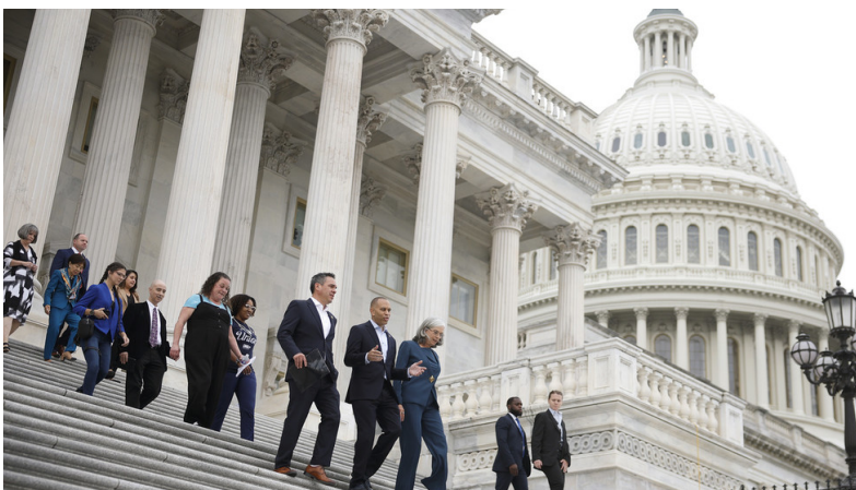
Democratic lawmakers walk down the steps of the US Capitol on September 30, 2025, in Washington, DC.

Republicans and Democrats have failed to break the Senate deadlock over spending priorities