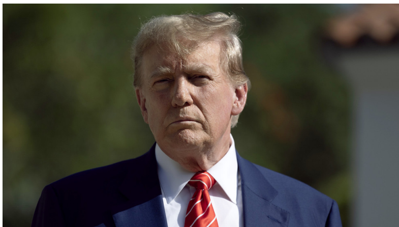
US President Donald Trump.

The lawsuit from California and Oregon seeks to stop a federal order deploying troops to Portland amid nationwide protests