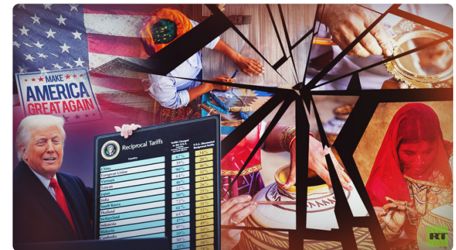
Here's how an ancient Indian craft is suffering under Trump's tariffs FEATURE