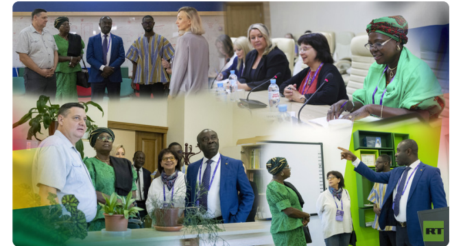
'I'm a converted guy already': Lawmakers from Africa find warmth in Siberia FEATURE

Dear readers! Thank you for your vibrant engagement with our content and for sharing your points of view. Please note that we have switched to a new commenting system. To leave comments, you will need to register. We are working on some adjustments so if you have questions or suggestions feel free to send them to feedback@rttv.ru . Please check our commenting policy