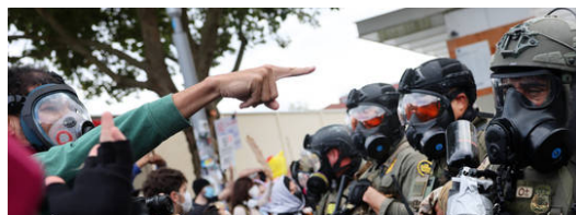
READ MORE: Police detain anti-ICE protesters in Portland (VIDEO)

The court order will remain in place until at least October 19 as the legal challenge proceeds.