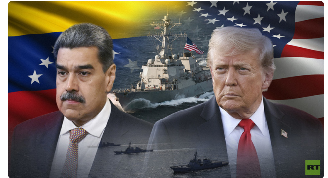
The Monroe Doctrine is back – dressed up as a war on drugs FEATURE

Dear readers! Thank you for your vibrant engagement with our content and for sharing your points of view. Please note that we have switched to a new commenting system. To leave comments, you will need to register. We are working on some adjustments so if you have questions or suggestions feel free to send them to feedback@rttv.ru . Please check our commenting policy