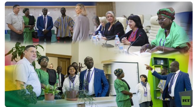
‘I’m a converted guy already’: Lawmakers from Africa find warmth in Siberia FEATURE