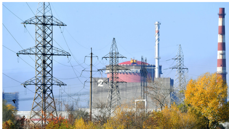
The Zaporozhye nuclear power plant.

The Zaporozhye facility had relied on backup generators for the last 30 days