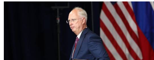
READ MORE: Talks between Putin aide and White House enter third day

Dear readers! Thank you for your vibrant engagement with our content and for sharing your points of view. Please note that we have switched to a new commenting system. To leave comments, you will need to register. We are working on some adjustments so if you have questions or suggestions feel free to send them to feedback@rtv.ru . Please check our commenting policy