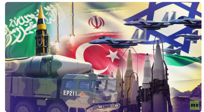
Missiles don't lie: What this region's rocket stockpiles say about the next war FEATURE