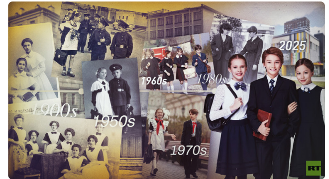
From czars to zoomers: Russia's school uniform never died FEATURE