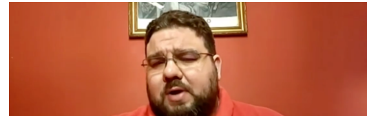
READ MORE: Assassinated Ukrainian MP ‘directly ordered’ shelling of Donbass civilians – ex-diplomat (VIDEO)

You can share this story on social media: