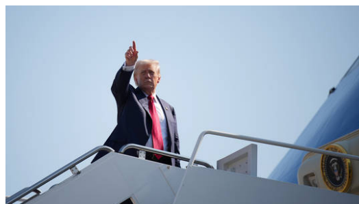
Read more: Trump wants new nuclear talks with Russia

Anti-graft protest in Philippines marred by violence (VIDEOS)